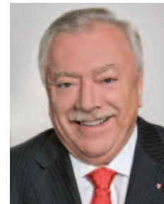
Michael Häupl Mayor and Governor of Vienna