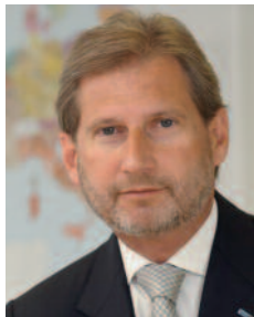
Johannes Hahn Member of the European Commission

The 3 RD ANNUAL FORUM OF THE EUSDR is a big opportunity to meet, discuss and decide the future of the Danube Region. It is about perspectives for our citizens. We look forward to meeting you in Vienna.