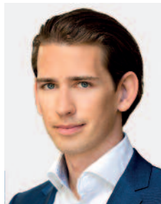
Sebastian Kurz Federal Minister for Europe, Integration and Foreign Affairs, Austria